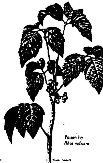
Poison Ivy Rhus radicans