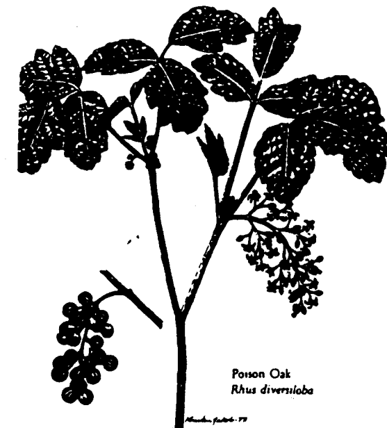
Poison Oak Rhus diversiloba